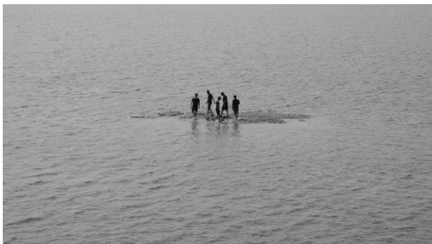
5 Ishu Han Musical Chairs 2015 Video installation, screen