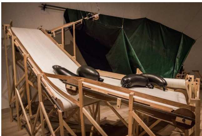
3 Nao Nishihara Bling Bling 2016 Mixed media Installation view: "Roppongi Crossing 2016: My Body, Your Voice" (Mori Art Museum, Tokyo, 2016)