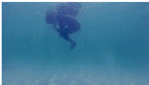
6 Ishu Han The thinker floats on the sea 2016 Video