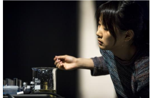
©Fluid Matter, Liquid and Life in Motion

Award: Cafe OTO / Sound and Music Embedded (UK, 2015), Jury selection for 17th Japan Media Arts Festival (Agency for Cultural Affairs, Japan, 2014).