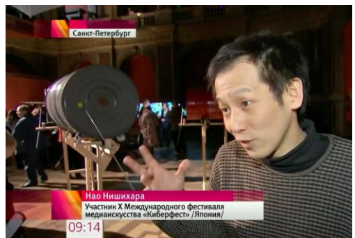
TV News Russia Channel 1 2017 https://www.1tv.ru/news/2017/01/26/

Recent exhibitions: "Cyber Art Festival 10" (St. Petersburg, Russia, 2017), "Ende Tymes VI" (Knockdown Center, New York, 2016), "Roppongi Crossing 2016: My Body, Your Voice" (Mori Art Museum, Tokyo). Recent performances: "Experimental Intermedia" (New York, 2016), "Issue Project Room" (w/ Aki Onda, New York, 2016), "Destination of the Stone" (w/ Min Tanaka and Rin Ishihara, Archa Theatre, Praha, 2016). Award: ACC Grant 2015 (New York).