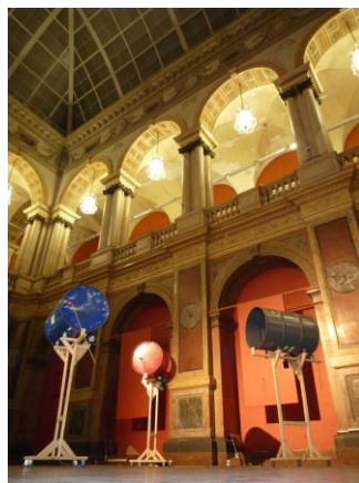
4 Nao Nishihara Oil Drum 2017 Oil drum, motor, wheels, rubber ball, aluminum rod, wood Installation view: "CYFEST 10" (St. Petersburg Stieglitz State Academy of Arts and Design, Russia, 2017)