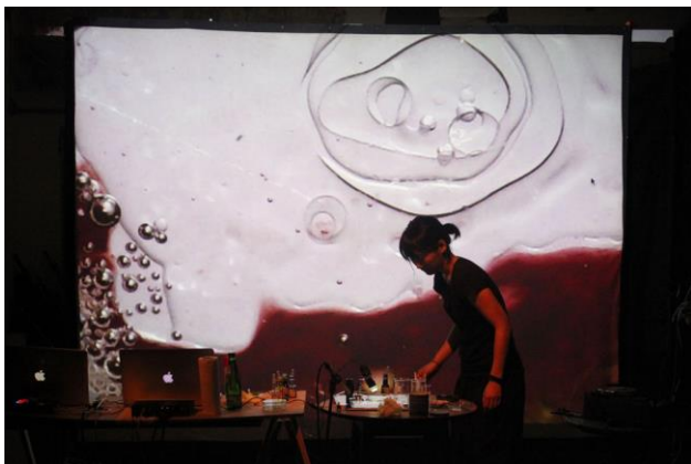
1 Mari Ohno cells 2016 Sound performance