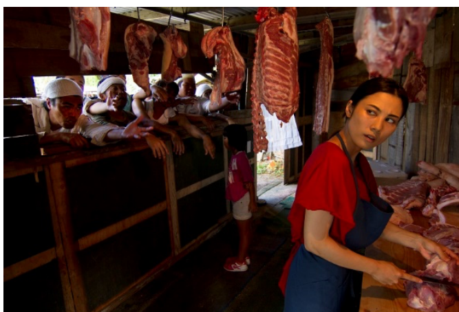
3. A Woman of the Butcher Shop , 2012 version, 3-channel video installation

Recent exhibitions: Solo Exhibition "Yamashiro Chikako: Reframing the land / mind / body-scape," Tokyo Photographic Art Museum, 2021, "Image Narratives: Literature in Japanese Contemporary Art," The National Art Center, Tokyo, 2019, "Kyoto Experiment 2018, Kyoto International Performing Arts Festival" 'Mud Man' (Exhibition) , And I Go through You (Performance), Kyoto Art Center, 2018, Solo Exhibition "Shapeshifter," White Rainbow, London, 2018 etc.