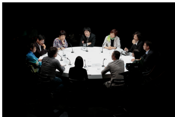
2. Les nucléaires et les choses , 2019