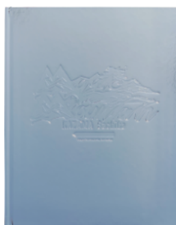
KAZAMA Sachiko "Magic Mountain"

■Reference: The TCAA 2019–2021 monographs currently available online