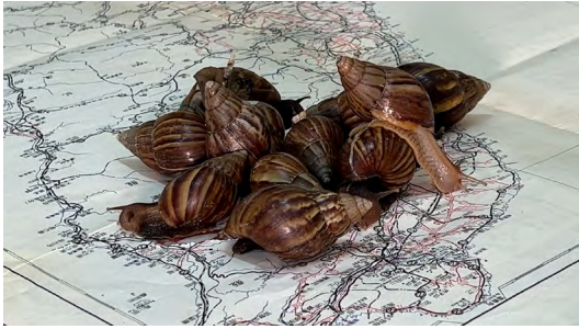
10. Singing Snail