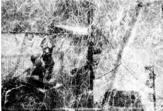
1. FOX TOOTH Photo developed in Yomogi and printed on Washi, 35mm 2023