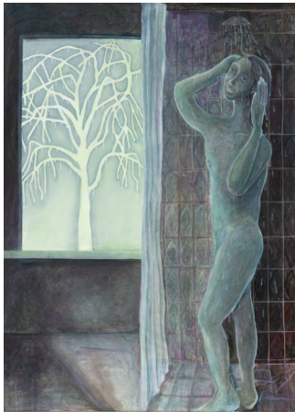
8. Ice storm