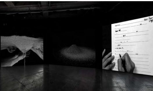
6. Korean Dictation Test_You Will Have to Answer the Questions You Hear (detail) 4 channel FHD video installation, stereo sound 2019