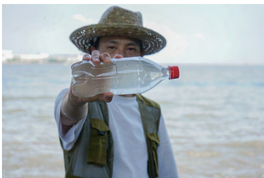
2. Performance 1 (Mouth of the Edo River) Performance 2023

【Profile】 Born in Hong Kong in 1984. Lives and works in Hong Kong. Graduated with an MA in Creative Media from City University of Hong Kong in 2017. Recent screening: “International Short Film Festival Oberhausen,” Germany, 2023.