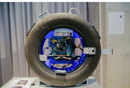
5. PC Gamer [GOMA] TOKIO Handmade PC with customized design 2024

【Profile】 Born in Seoul in 1976. Lives and works in Seoul and Gyeonggi-do. Graduated with an MFA from Goldsmiths, University of London in 2017. Recent exhibition: "Post Modern Children," MoCA Busan, 2023.