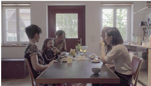
9. Chat about connection (godparents, room-sharing, naming)

【Profile】 Born in Tokyo in 1991. Lives and works in Tokyo. Graduated with an MFA from Tokyo Zokei University in 2016. Recent exhibition: "INSOMNIA/Waiting for the wave," THE SECRET MUSEUM / tata book shop gallery, Tokyo, 2023.