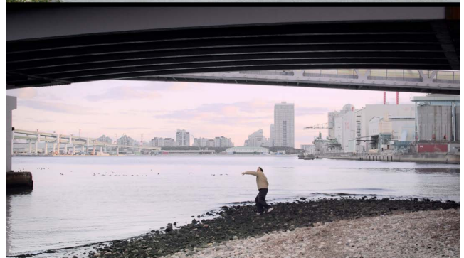
9. Becoming Neighbors , 2025 Two-channel video installation, sound, ball