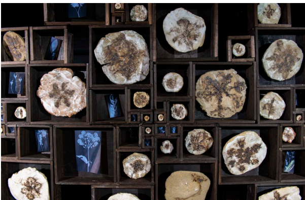
4. Ornament of life , 2021 Ceramic, negatives, wood

Recent solo exhibitions: “TOKAS-Emerging 2021 ‘Distorted Symmetry,’” Tokyo Arts and Space Hongo, “one leaf, one Loop,” ART TRACE Gallery, Tokyo, 2017. Other activities: “Independent Activity Program 2025 Summer,” YUI-PORT, Niigata, “Local Emerging Creator Residency Program 2024,” Tokyo Arts and Space Residency, 2025, “ART TRACE GALLERY 2004 – 2024,” ART TRACE GALLERY, Tokyo, 2025, “Trolls in the Park 2024,” Zenpukuji Park, Tokyo, “Nakanojo Biennale 2023,” Yamase, Gunma.