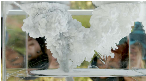
7. Before It Happens , 2022 HD video, sound

Recent solo exhibitions: "Topophilia," Tomioka City Museum / Fukuzawa Ichiro Memorial Gallery, Gunma, 2023, "TOKAS-Emerging 2022 'A Fire on My Palm'," Tokyo Arts and Space Hongo, "The Pioneers," VIENTO ARTS GALLERY, Gunma, 2020. Other activities: "Tunnel (Art Event Produced by 《neru》)," OAG Art Center Kobe, 2025, "The 14th MAEBASHI MEDIA FESTIVAL 2024 plus," re/noma, "Minikino Film Week 8, Bali International Short Film Festival," Bali, Indonesia, 2022. Recent grant/award: "Contemporary Art Research Grant," Toshiaki Ogasawara Memorial Foundation, 2025, "Image Forum Festival 2018," Nominated.