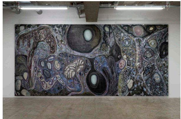
2. Soil Psychedelia , 2023

Photo: ITAMI Go Courtesy of CAVE-AYUMI GALLERY ©2025 AKAHANE Fumiaki