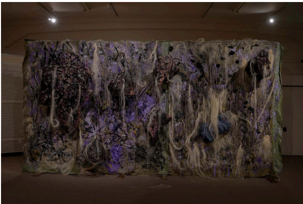
1. cell/skin/hole , 2023

Recent solo exhibitions: “Life and Circulation,” Informel Nakagawamura Museum, Nagano, 2024, “Soil Psychedelia,” CAVE-AYUMI GALLERY, Tokyo, 2023, “Fumiaki Akahane SOILS AND SURVIVORS,” Suwa City Museum of Art, Nagano, 2023. Other activities: “Residency Program,” Casa Wabi, Puerto Escondido, Mexico, 2025, “VOCA The Vision of Contemporary Art 2023,” Ueno Royal Museum, Tokyo. Recent award: “Izumi Kato Prize x Fundación Casa Wabi 2024 – 2025,” Recipient.