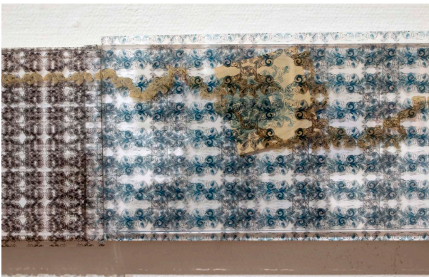
6. Ornament Line , 2024 Old Japanese banknotes, UV print on acrylic, oil-based pen