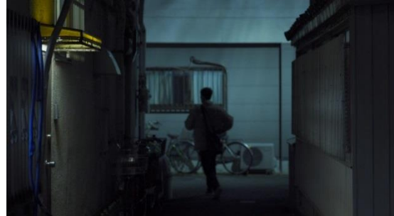
1. Johatsu , 2019, Video installation