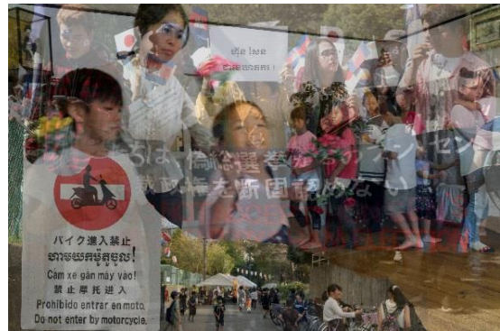
12. A good event in Tokyo 2018, 2018-2019, 1 channel video with sound.

Born in 1987 in Prey Veng, Cambodia. Lives and works in Phnom Penh. Graduated with a BA in Economy from Norton University in 2010. Major exhibitions include "Sa Sa Art Project," Sydney Biennale, 2018, "The Life of Things," Jendela, Esplanade mall, Singapore, 2018, "Sunshower: Contemporary Art from Southeast Asia 1980s to Now," The National Art Center, Tokyo, Mori Art Museum, 2017, "National Road Number 5," Art Stage Singapore, Singapore, 2016 etc.