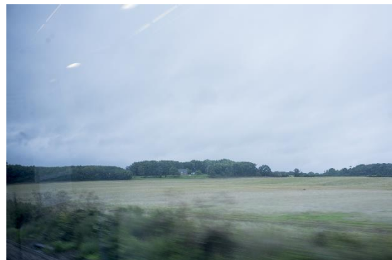
13. Lost Sight, Production Still, 2017/2019, Mixed media (Digital slide projection, sound) © Miyagi Futoshi

Considering the degree to which he can sympathize with those with very different positions, Miyagi Futoshi uses a slide-show format to depict a narrative about men who "disappeared" from two perspectives. The first, focusing on a relationship between men living in England at a time when homosexual acts were still forbidden, is interwoven with a story about women who did not yet have a voice.