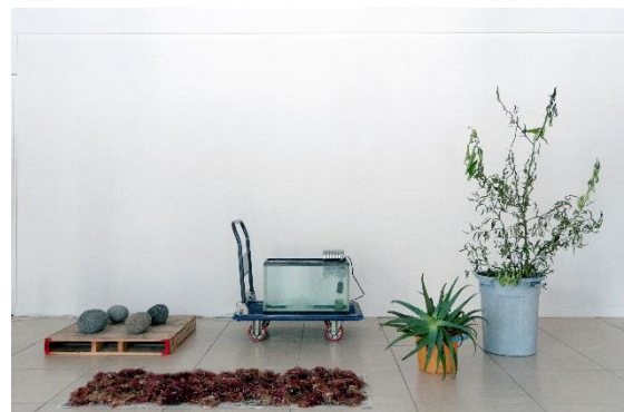
8. Portrait of Objects, 2018-, Project