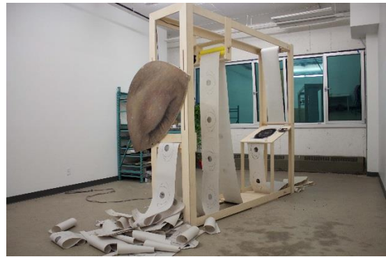
3. Penalization for sight dependency , 2018, wood, blade, mortar, paper, paint

Matsuda Chika makes work in which she alters readymade goods and images with established uses in order to nullify them. Attempting to reverse the system, Matsuda was inspired by maple trees and maple syrup, a Canadian specialty, to create her installation for this exhibition.