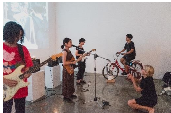
2. The Use of Energy , 2018, installation, performance

Since 2011, Makizono Kenji, who has a strong interest in the energy industry, examined the relationship between the individual and society, and energy and daily life before exploring the potential for artistic expression that emerged from this process. During his residency in Seoul, Makizono recruited local musicians to form a rock band, and in this exhibition, he is expected to show documents and a video installation based on themes such as electric problems and collaborating with other people.