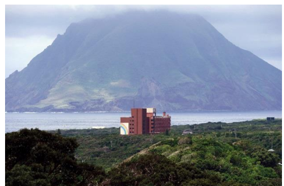
9. Hachijyo-jima (working title), 2018-, Project