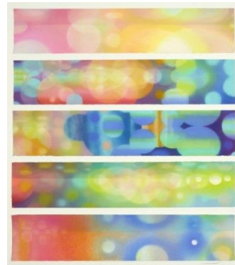
6. Chords , 2018, Pastel on paper, Photo by Yasuyuki Kasagi

Dealing with subjects such as light, color, and somatic sensations, Soya Asae makes paintings that depict light and installations that manifest the physical state of perceiving light. Exploring human perception and creative mechanisms from manifold perspectives using a variety of expressive forms, Soya strives to embody the sensorial realm that was once inherent to human life.