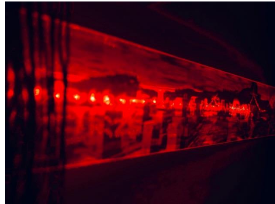
5. Red Sky (detail), 2018, Installation (detail)