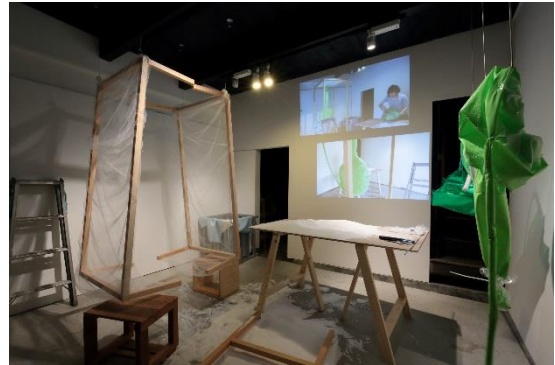
14. Approach 0.1, 2017, Performance