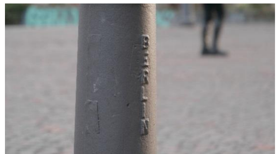
4. Over The Border , 2019, HD video