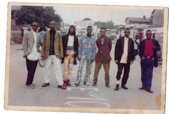
15. Comme des Kinois I , 2018, Photograph (scan)

Henrike Naumann's research focused on the fashion connection between Tokyo and Kinshasa (Democratic Republic of the Congo) through the subculture of sapeurs. Sapeurs from the Bandal district of Kinshasa are obsessed with Japanese designer brands. The artist exhibits an installation with objects and a video work (produced with support of Kunstverein Leipzig) that explores how fashion items mediate experiences and memories through different cultural contexts. She draws connections between what was labelled ‘Hiroshima Chic’, the burst of the Japanese bubble economy and post-war fashion in Congo.