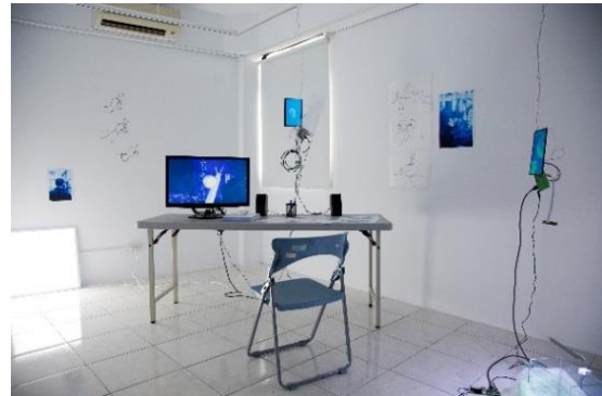
7. Taipei Perception , 2018, Installation view (detail)

Born in 1985 in Hiroshima. Lives and works in Ishikawa. Doctoral program completed with expulsion in Kanazawa College of Art in 2014. Recent exhibitions include "2018 Season 4 Treasure Hill Residency Artists Exhibition," Treasure Hill Artist Village, Taipei, "Aperuto 06 Yusuke Takeda," 21 st Century Museum of Contemporary Art, Kanazawa, Ishikawa, 2017, "AT LAST FOR NOW, THE CITY IS THERE TO BE EXPLOITED," WAITINGROOM, Tokyo, 2015, "VOCA –THE VISION OF CONTEMPORARY ART," The Ueno Royal Museum, Tokyo, 2015 etc.