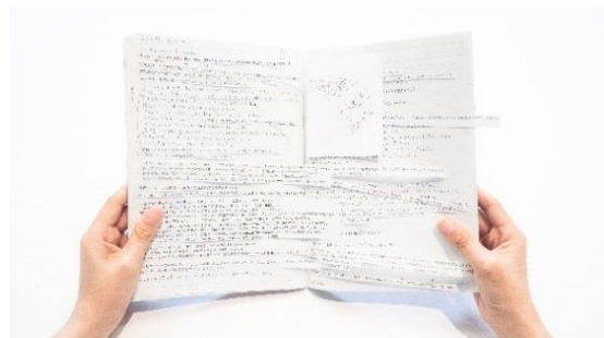
11. mí El Camino , 2018, Diary for the artist's 31-day pilgrimage to Santiago (made by combining text fragments collected from various personal weblogs on the Internet and the artist's own writings), inkjet printing, drawing, video