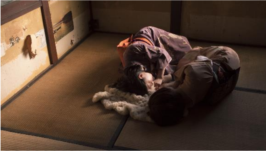
3. Breathing House Film, 2017