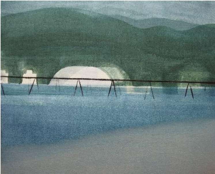
2. factory Oil on canvas, 2018

Rather than reproducing actual scenery, Nishimura depicts the present moment while layering in the things he takes notice of in daily life. His paintings resemble landscapes or people you have seen somewhere before, or scenes from a tale. In this exhibition, they are displayed in the space in a way that naturally suggests a story linking the works next to each other. He will exhibit new paintings inspired by early spring at this exhibition, with the aim of inspiring viewers to spin new stories.