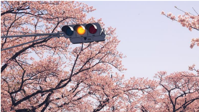
1. fukushima trace single channel video, 2018

Sato films actual scenery and creates animations by tracing the individual frames on a computer. He released Tokyo Trace (2015-2016), which depicts the changing scenery of Tokyo, followed by fukushima trace (2018), his new video installation for this exhibition showing daily life in Fukushima. This piece, created during his fight with cancer, expresses the scenery of Fukushima (where he has traveled after the earthquake) while superimposing it on his own body being ravaged by cancer. Part of it is animated, blurring the lines between the ordinary and extraordinary and beckoning the viewer into the video.